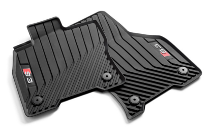
Sport Floor Mats