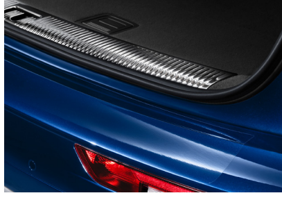
Loading Sill Protective Foil