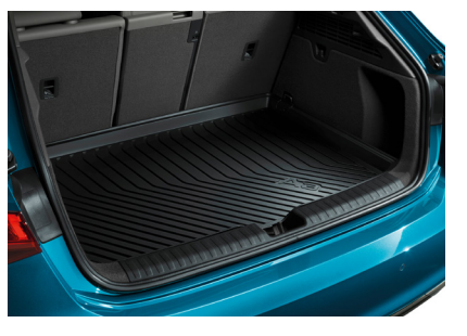
Luggage Compartment Liner