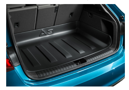
Rigid Load Liner